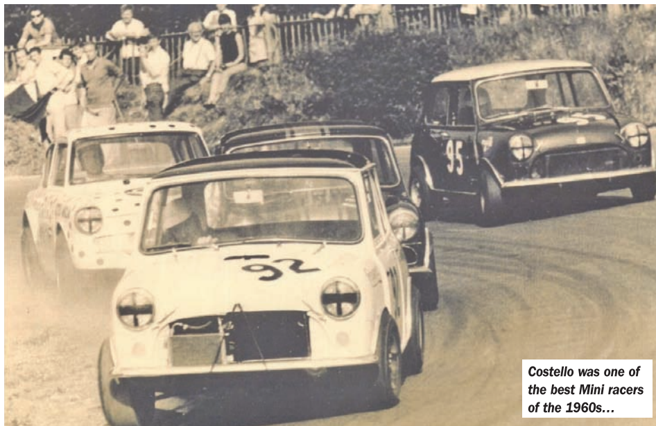
Costello was one of the best Mini racers of the 1960s...

Today, MGB V8s are ten a penny and such is the size of the aftermarket that you can build one like a giant Meccano kit. But without Ken Costello's foresight the car probably would have remained a "what if?".