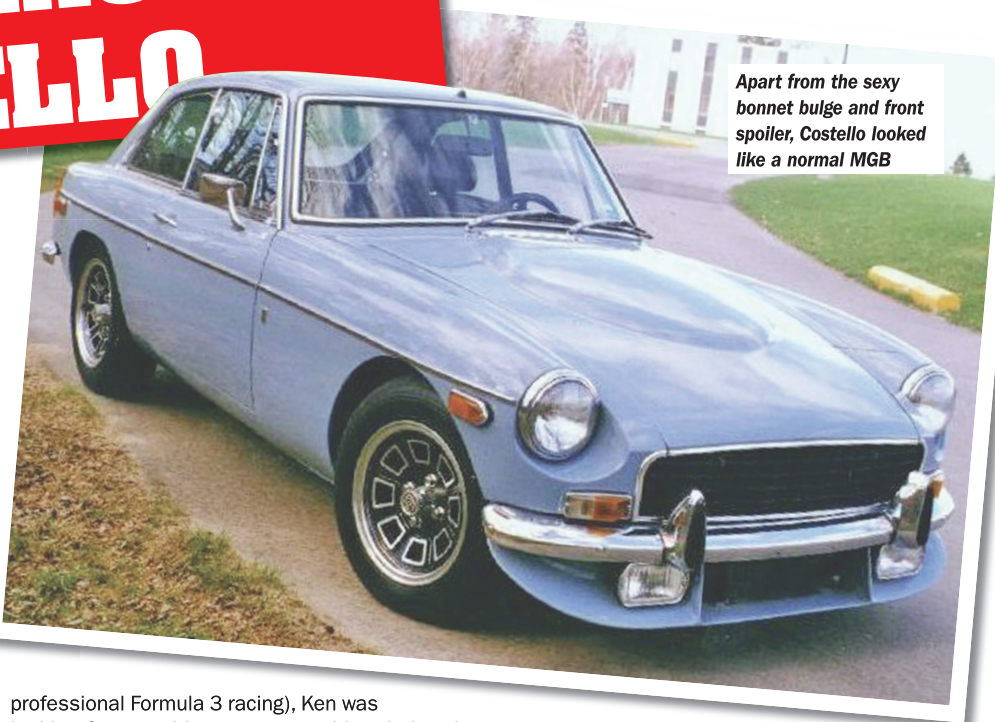
Apart from the sexy bonnet bulge and front spoiler, Costello looked like a normal MGB

By 1969, around the same time that the ill-starred MGC was dumped (and after a spell in