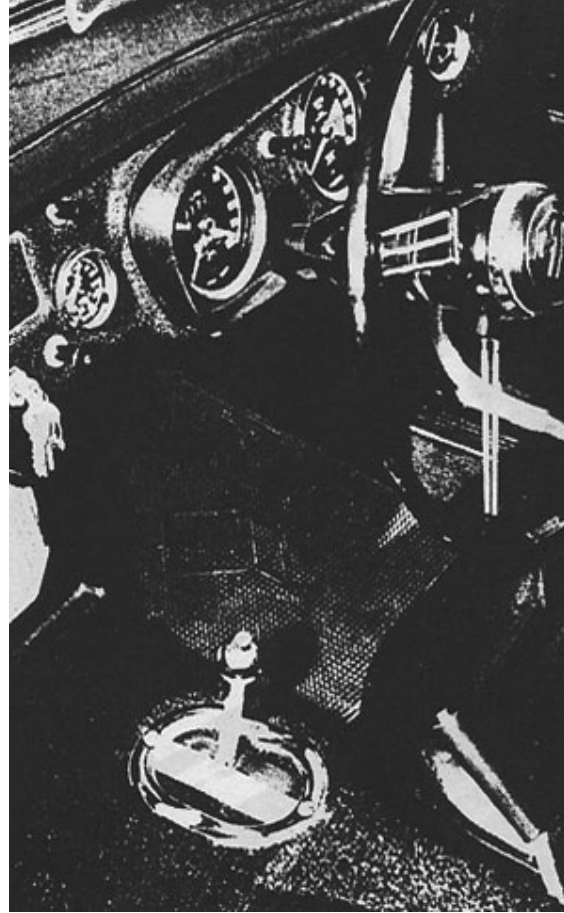
The finished job defies detection completely. Apart from the enthusiastic MGB fan, we'd defy anyone to pick the fact that this car has an alloy V8 nestling under the hood.

The clincher came when a friend just happened to be looking for a little-used 1967 MGB engine and transmission. So, $540 later, Mark was looking into the hole where the B engine had been.