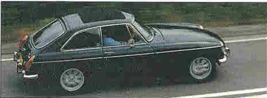
With over 200bhp on tap, performance is electrifying. Mechanical ABS brakes excellent

On the road, the car is nothing but pure delight. It's improved front suspension is immediately obvious: the unassisted steering still has a typically MGB slightly woolly