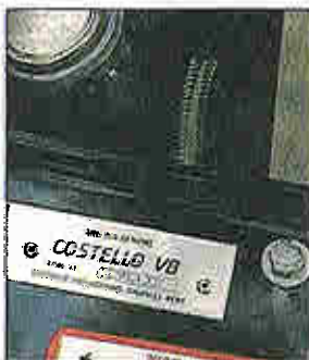
Discreet badge in engine bay

And if that's not enough attention to detail for you, there's an all-leather interior, a Momo steering wheel (of 1in smaller diameter), revised backrest padding to give the seats more side support, and a set of air horns.