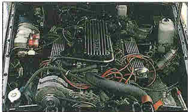
4-litre power, blueprinted and balanced, burns super green

There is evidence of painstaking development work all over the car. The heater fan has had its blades modified to provide a better airflow into the cabin. The car has an added central brake-light because Costello thinks they're safer. The sunroof is in mohair, not vinyl. The MGC diff contains a Quaife limited slip mechanism, because Costello thinks it's a must in a car of this power (working with the overdrive top gear it gives around 27mph/1000 for exceptionally easy cruising).