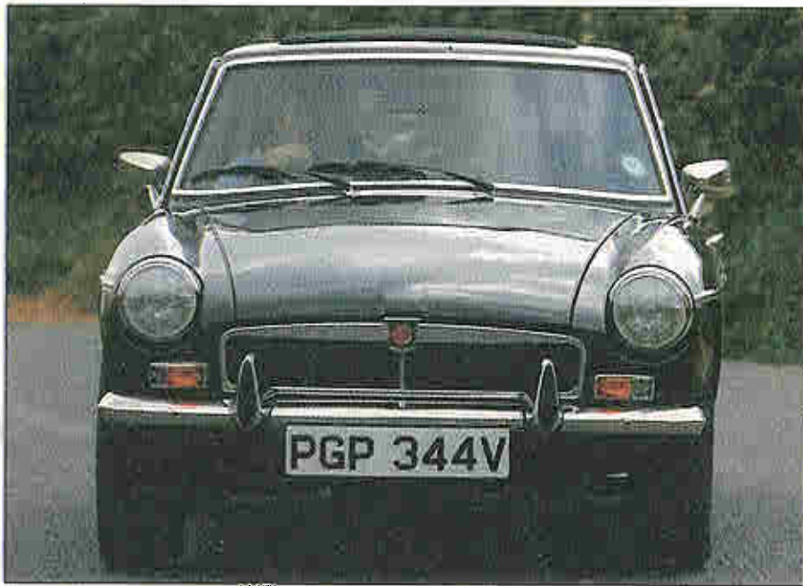
Hard acceleration proves awesome power, with little axle tramp. Grip in dry is prodigious