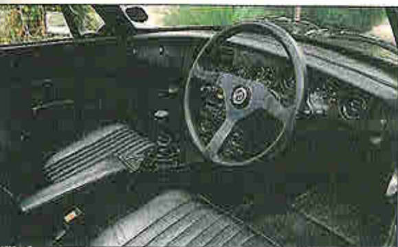
All-leather interior and Momo wheel provide luxury feel

directness but the front wheels resist oversteer far better than standard, and the body rolls less.