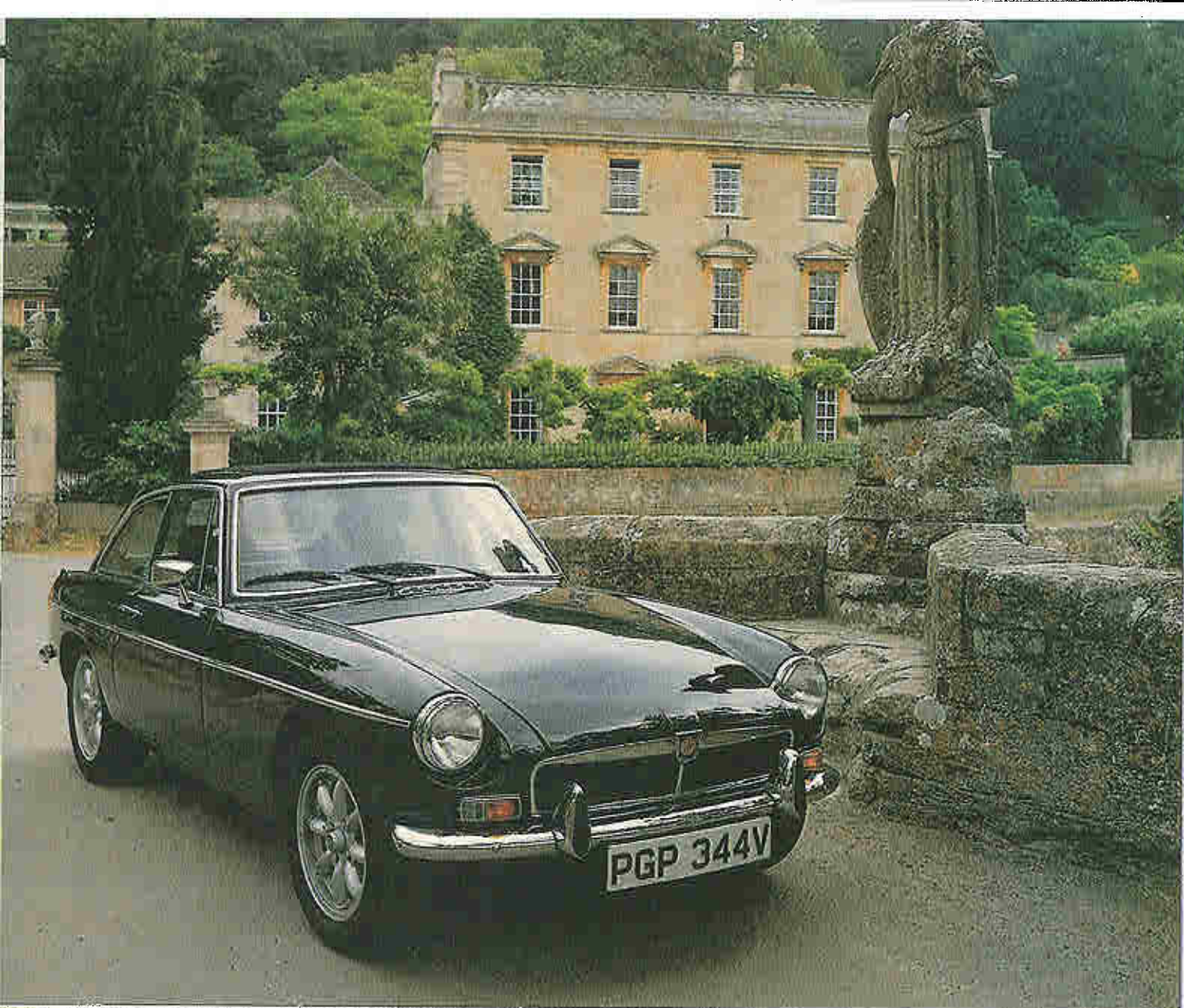
Completely reworked suspension and Minifite-style wheels give Costello V8 a purposeful stance. A thoroughly modern car with classic good looks